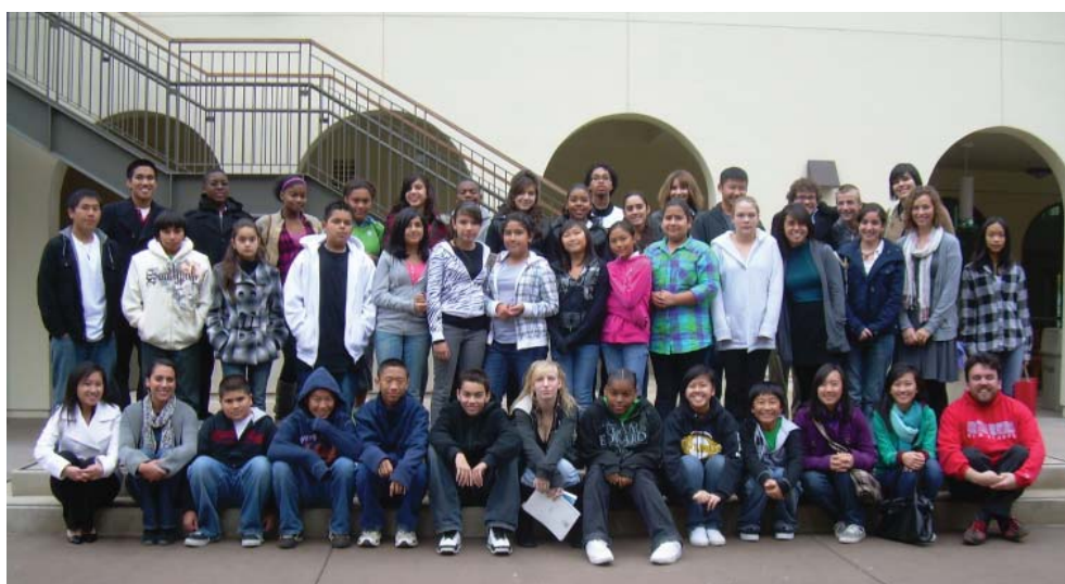
Breakthrough students and summer faculty meet for lunch at SCDS before attending the Sacramento Ballet's performance of The Nutcracker .